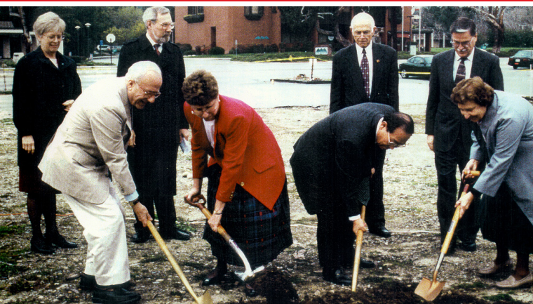
Groundbreaking ceremony for the new 300 W. Foothill Blvd. facility