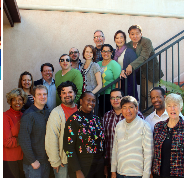
2012 - First Seed Planters program participants