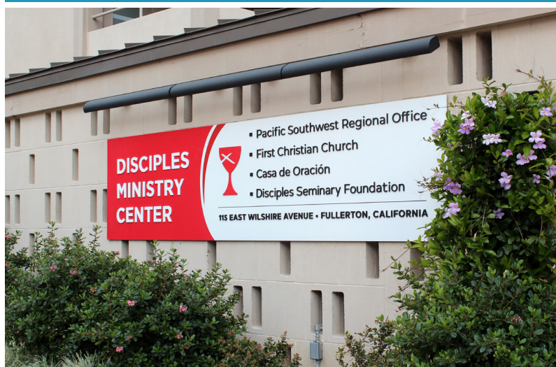
DSF offices move to 115 E. Wilshire Ave., Fullerton, CA