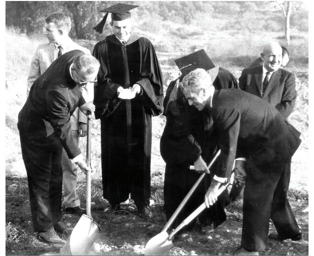
1964 groundbreaking ceremony

DSF's first Board of Directors begins raising money and search for an Executive Director. DSF is incorporated on October 20, 1960.