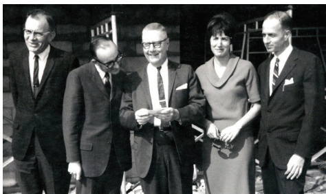
DSF board members - 1965