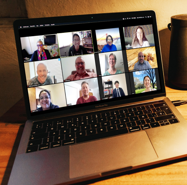
Student events and classes move online due to the COVID-19 pandemic

“Personally, I have so many, many memories of events and relationships nurtured in the DSF building/space. After many years on the Board, I am aware that these memories are mostly about people! The DSF space brought faithful Disciples and UCC leaders together on the Board, who in business deliberations exchanged ideas, passions, and visions for the enriching of the journey of vocation for hundreds of seminarians. In our board meetings, we met people we never would have met and in meetings, breaks, and meal times, the Spirit bonded us across many borders of race, ethnicity, theology, LGBTQ+, education, etc. into a “Beloved Community.” Beyond the value of Board relationships, the opportunity to interact with so many seminarians was a gift and blessing. How thrilling to hear the words and feel the hearts and sense the souls of those who were already providing dynamic leadership, but we could see that the Disciples church and broader faith were in the hands of passionate and committed followers of The Way.”