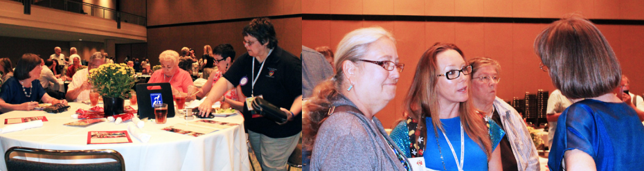
DSF Luncheon at General Assembly in 2013