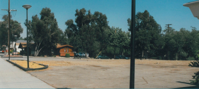
Empty lot at 300 W. Foothill Blvd. before DSF construction began