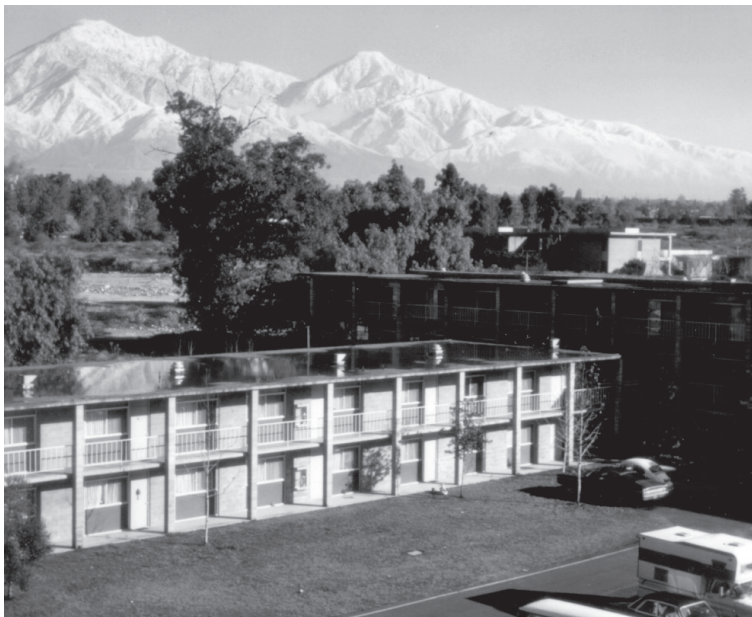
DSF's first facility with apartments and office spaces