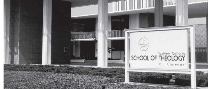
DSF's first facility was located on the STC campus

DSF's First Building: A vigorous capital campaign helps DSF construct a building at STC. Dedication day for that property occurs on October 24, 1965, with nearly 750 persons participating in a service and walking through the 30 apartments, lounge, dining room, library, and office complex.