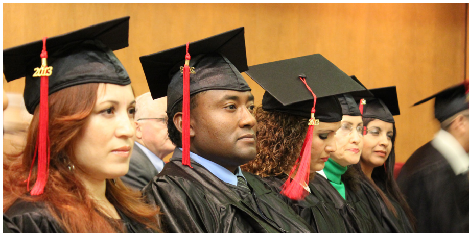
2013 Spanish language Certificate of Ministry Studies graduates