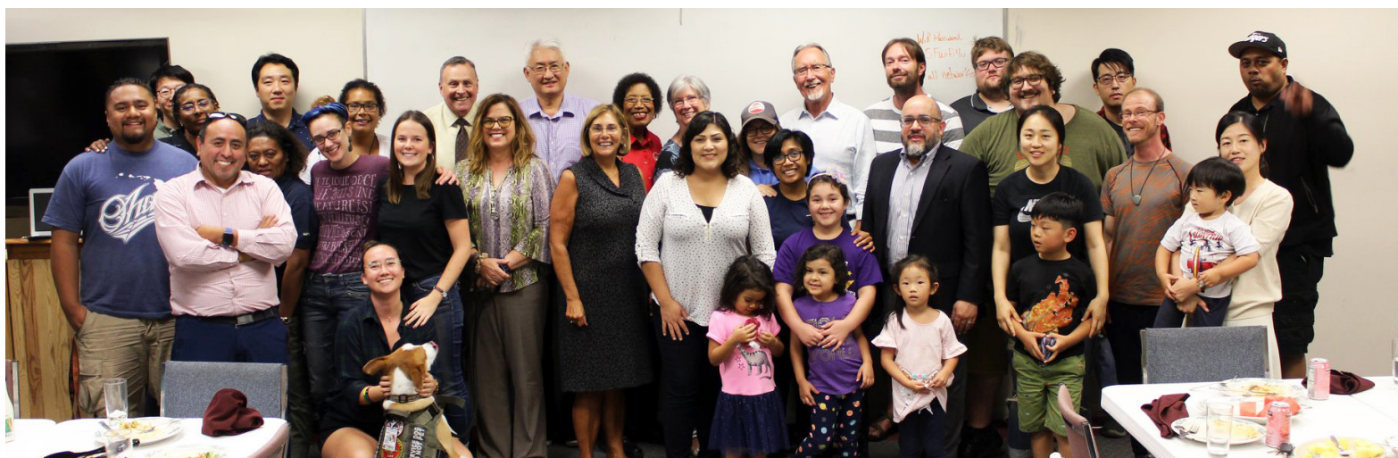
Fall Welcome Students Dinner in Claremont - September 2019