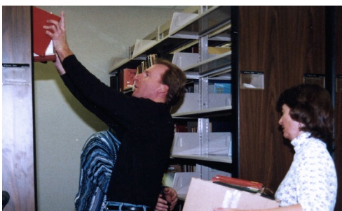
1999 - Moving into the new DSF library