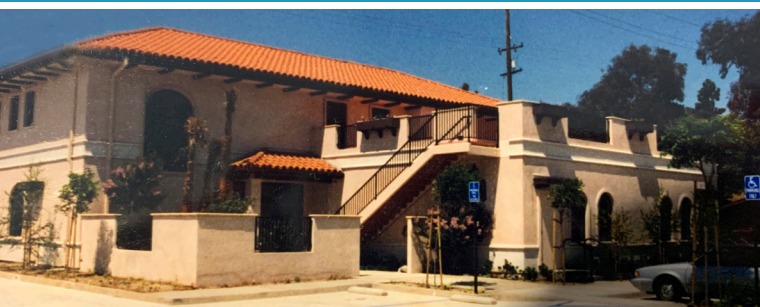
Construction completed at 300 W. Foothill Blvd.