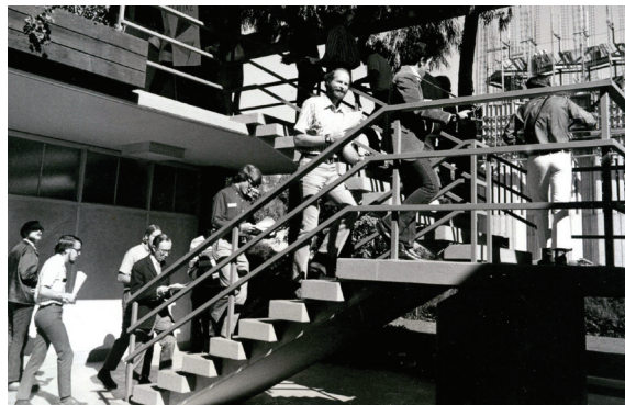
Students on the STC campus, 1972