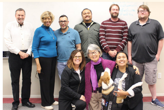
DSF @The Table - February 2019

Fall semester Diploma of Ministry Studies program begins, offering more advanced theological instruction for graduates of the CMS program.