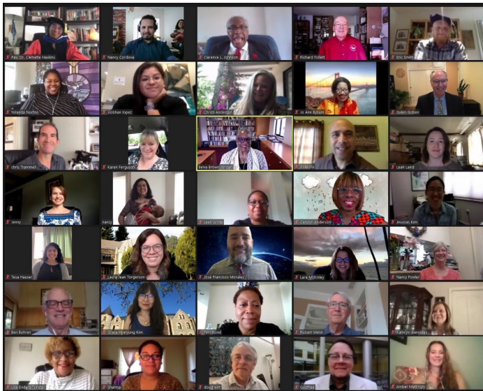
DSF's 2020 virtual seminary graduation celebration