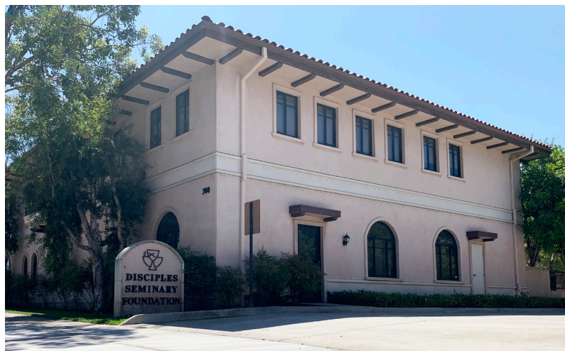
DSF building at 300 W. Foothill Blvd. sold - Feb. 8, 2021