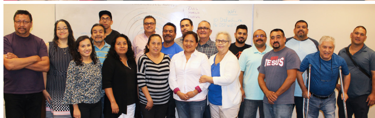
CMS classes offered at 300 W. Foothill Blvd. - 2018