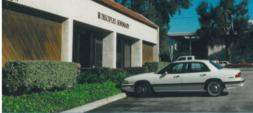
DSF's lease space prior to the completion of 300 W. Foothill facilities