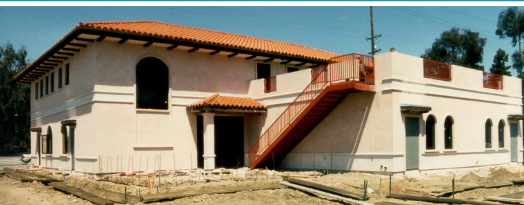
Construction underway at 300 W. Foothill Blvd.